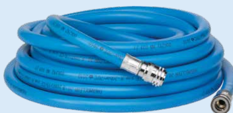
Item no. 93353, 10000 mm Item no. 93363, 15000 mm Item no. 93373, 20000 mm