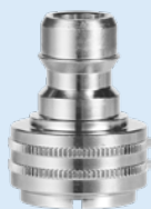
Item no. 880700 Water Tap Nozzle with 1/2", 3/4" & M22 Internal Thread, 1/2" (Q)