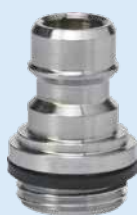
Item no. 880712 Nozzle with 1/2" thread for 9324x, 1/2" (Q)