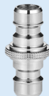
Item no. 880705 Male/Female Coupling