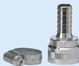
Item no. 881701 Hose Coupling, 1/2" (C)