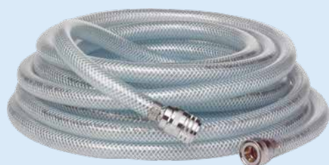
Item no. 93315, 10000 mm Item no. 93325, 15000 mm