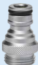
Item no. 88070952 Nozzle with 1/2" Thread for Gardena/ Hoselock hose coupling, 1/2" (C)

For Gardena/Hoselock system select these couplings: