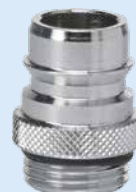
Item no. 880715 Nozzle with 1/2" thread for 9324x, 3/4" (Q)

For Gardena/Hoselock system select these couplings: